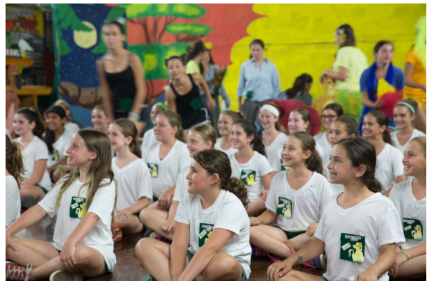
Color War 2013: Boys' Rope Burn and Girls' Sing