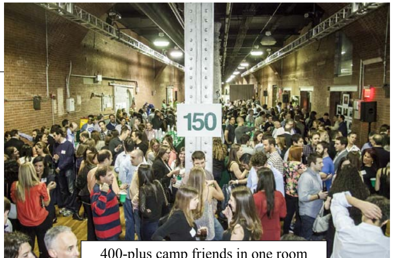
400-plus camp friends in one room makes for a lot of noise and energy!

Special thanks again to Shira Savada (1990s-2010s) and Ally Lipton (1980s-90s), who did much of the heavy lifting to make this event a reality, coordinating everything from the decorations to the social media networking to the catering. Shira returns to camp this summer to once again help run the girls’ one-week Scatico-in-Training program. Ally’s last year at Scatico was 1993, but she’ll be back in Elizaville in 2014 to launch our new Culinary Program. A new building is going up on the site of the former back shop and Ally will run cooking classes for campers.