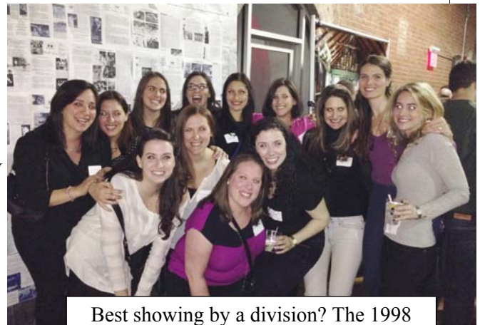
Best showing by a division? The 1998 Soopers. Fourteen of 18 attended.

A few more reunion photos on page 2—plus, email us at www.scatico.com and we’ll send you a link to more than 250 pictures.