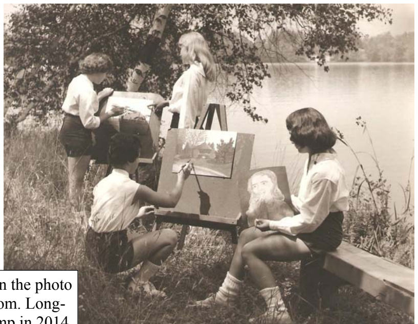
1940s— The painting being worked on in the photo to the right hangs today in the dining room. Long-sleeved shirts? Not a look you see at camp in 2014.