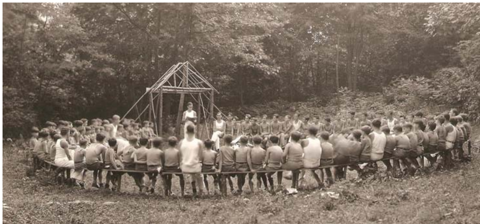
85 Years Ago— It’s not an Alumni Newsletter without at least one photo from the pre-1934 site in Wingdale, NY. This campfire took place in the summer of 1929—still months away from the October 24th “Crash” of the Stock Market on “Black Thursday.”