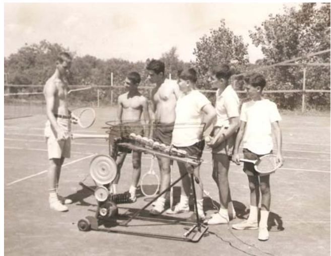
Vintage Scatico: Two sights no longer seen at camp... to the left—the Vomit Wheel on girls back campus; to the right—clay courts and wooden tennis racquets (and we also love that ball machine).